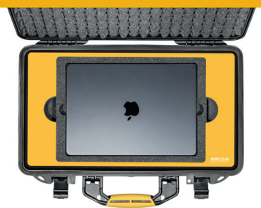
MACBOOK PRO 14" LAYOUT