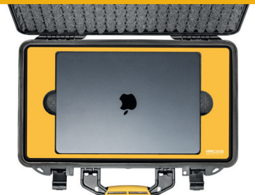
MACBOOK PRO 16" LAYOUT