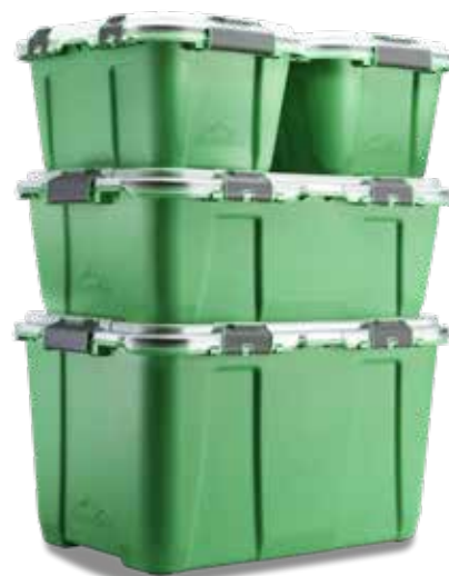
Alstora Full Set