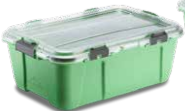
Alstora 46 L | 12 GAL