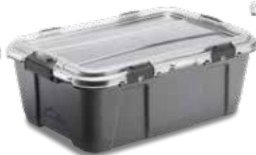
Alstora 46 L | 12 GAL