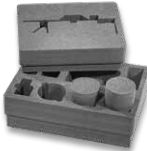
Milled and water cut foams