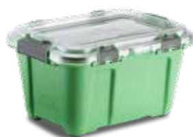
Alstora 19 L | 5 GAL