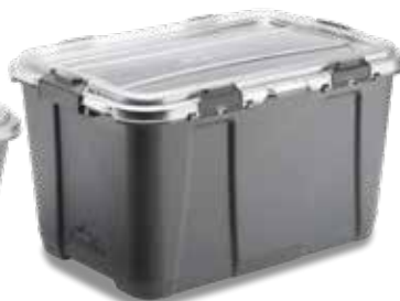
Alstora 76 L | 20 GAL