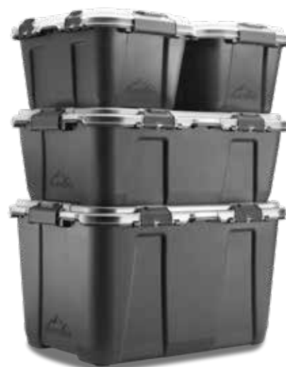
Alstora Full Set