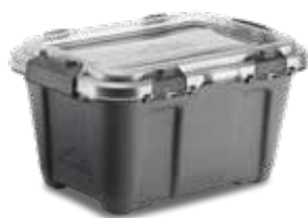
Alstora 19 L | 5 GAL