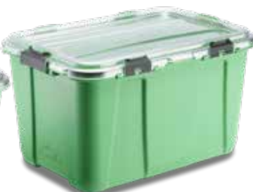
Alstora 76 L | 20 GAL