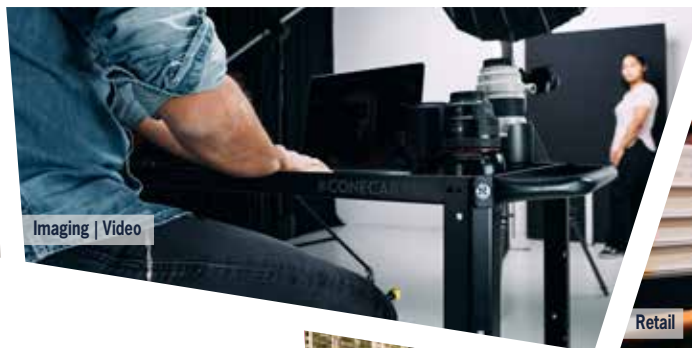
Imaging | Video